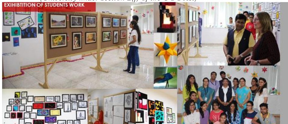
Picture 5: Artists' works are displayed, and workshops are conducted during orientation week for local design aspirants.