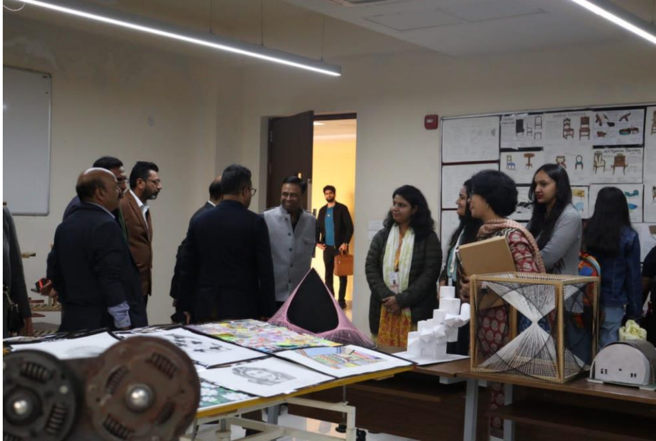
Picture 1: Manipal University Jaipur ensures that exhibitions and galleries are accessible to diverse audiences