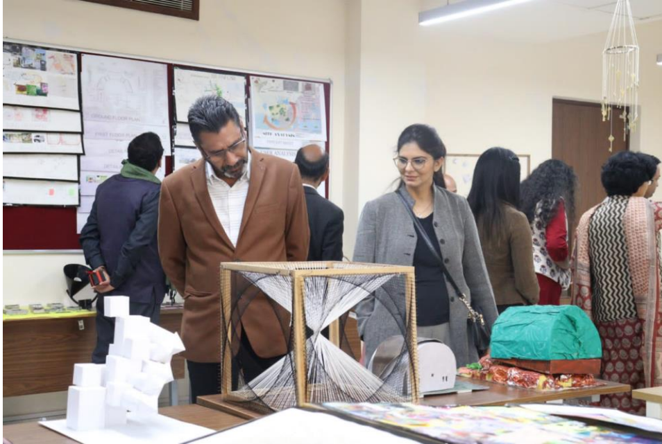
Picture 3: Collections of art and artefacts is a testament to its dedication to preserving culture and fostering community connections